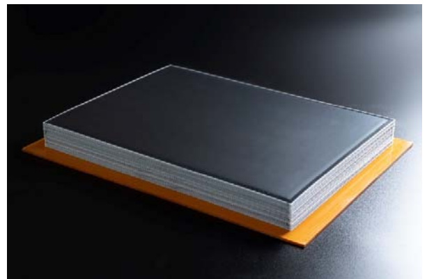
Inner structure Bipolarly connects 40 battery cells in series